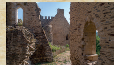
The inhabitants of Limoges have the fortress torn down.

This was the time of the Wars of Religion*. In 1594, ultra-Catholics wanted to come and set up in the château. To stop them, the city of Limoges sent 100 labourers to pull down the fortress. Within just four days, Châluçet was reduced to an utter ruin.