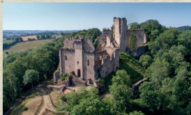
Creation of the Château de Châluçet (top and bottom) by the Jaunhac family.